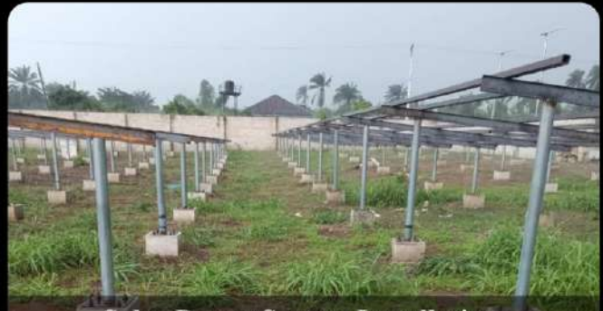
Solar Power System Installation - Multipurpose Clinic, Ugwunabo