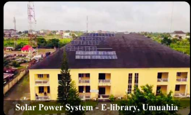
Solar Power System - E-library, Umuahia

Installation of 200KWp / 100KW / 100KWh Solar Power system at Multipurpose Hospital – Ugwunagbo: 65%; Installation of 60kWp / 50kW / 54kWh Solar Power CBT Centre Mbato Sec Sch. – Isiala Ngwa S.: Completed; Installation of 20KWp / 21kva / 40.32kwh e-Library Umuahia completed; and Installation of 177KWp / 150KVA/ 430KWh – Diag./Eye Centre Umuahia: 70%