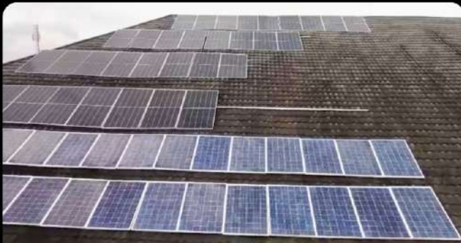
Solar Power System - E-library, Umuahia