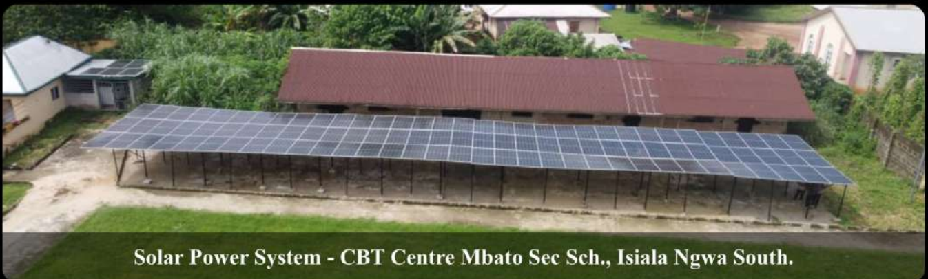
Solar Power System - CBT Centre Mbato Sec Sch., Isiala Ngwa South.