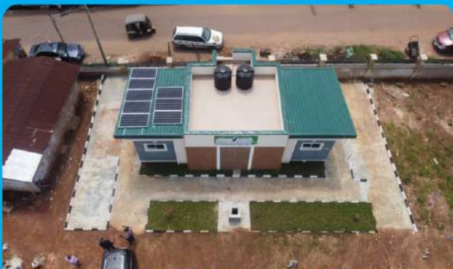
Modern WASH Facility - Okigwe Park, Umuahia

Construction of Pilot Modern Wash Facility at Okigwe Park - Umuahia Completed.