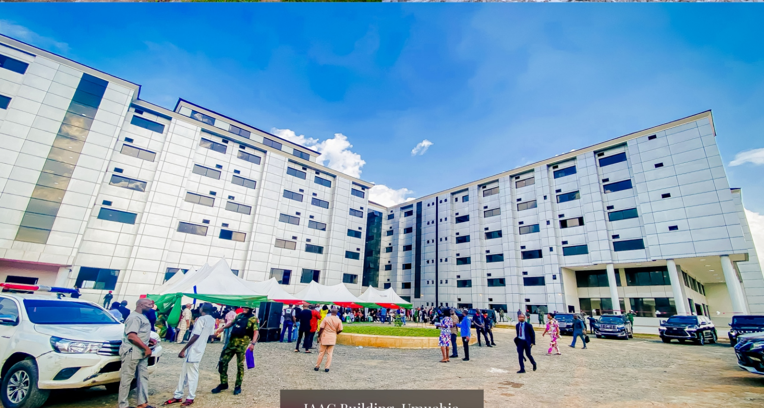
JAAC Building, Umuahia