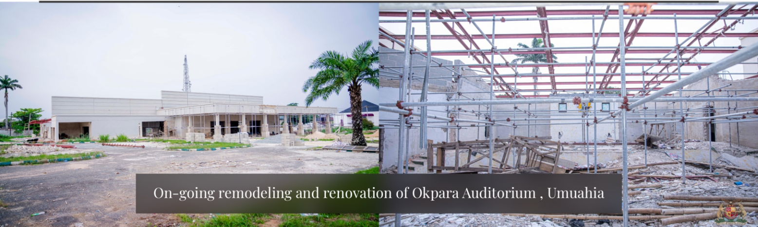
On-going remodeling and renovation of Okpara Auditorium , Umuahia