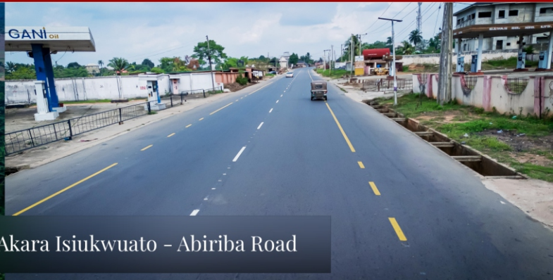
46.36km Umuahia – Uzuakoli – Akara Isiukwuato – Abiriba Road