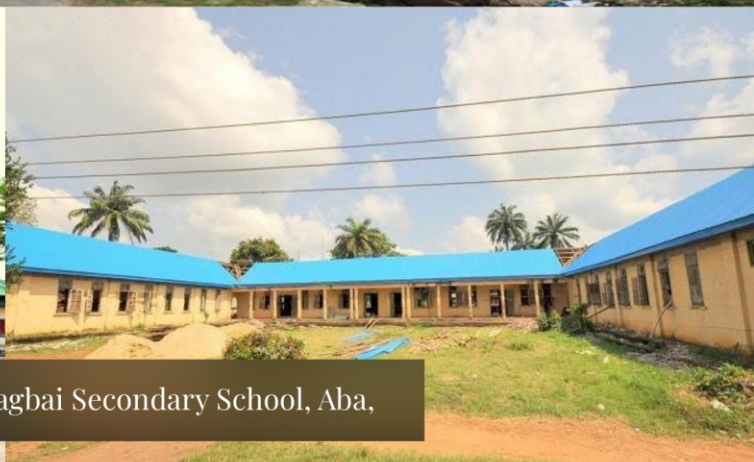
Ongoing reconstruction of Umuagbai Secondary School, Aba.