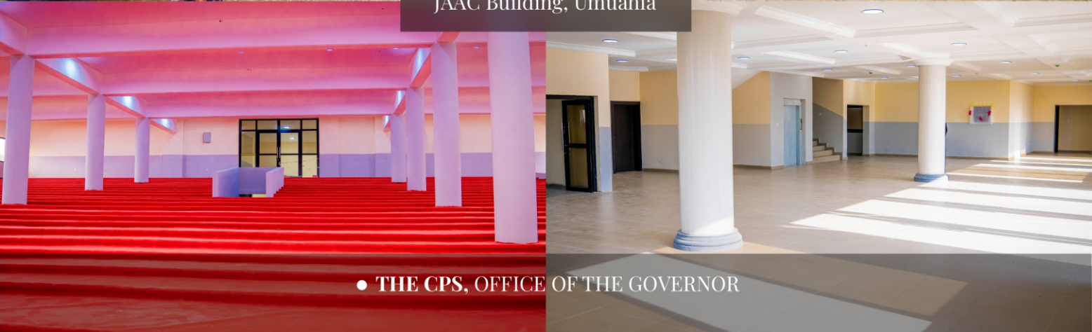
● THE CPS, OFFICE OF THE GOVERNOR