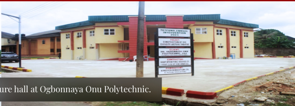
Lecture hall at Ogbonnaya Onu Polytechnic.