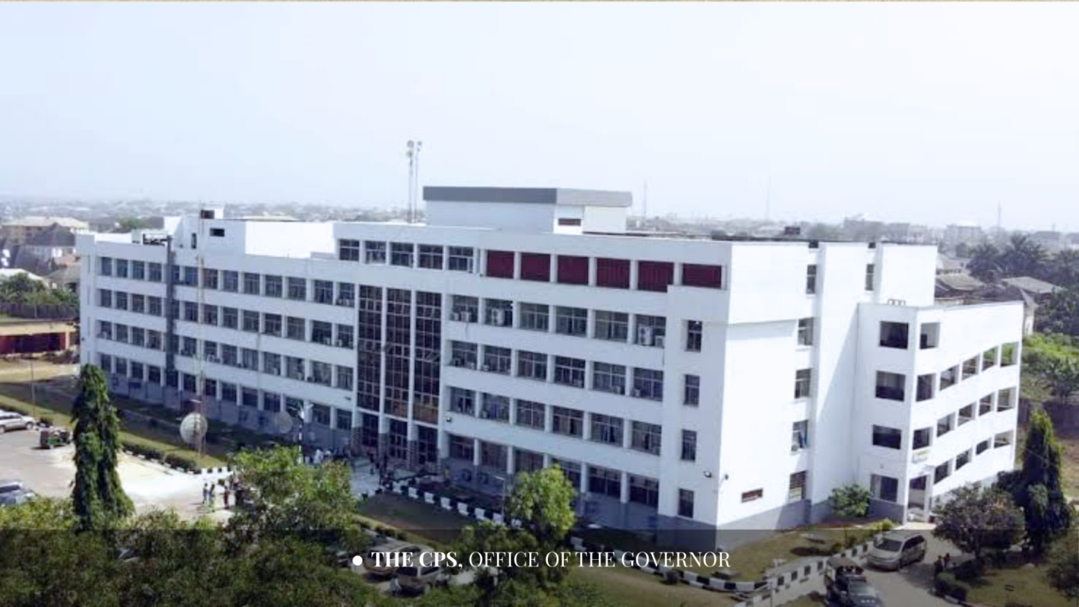
● THE CPS, OFFICE OF THE GOVERNOR