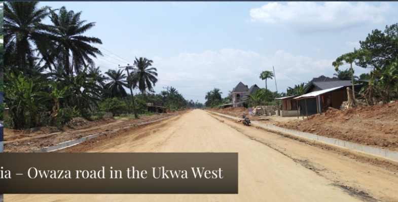
11.1-kilometer Obehie – Umudobia – Owaza road in the Ukwa West