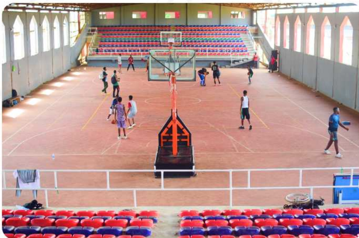
KANU NWANKWO INDOOR SPORTS HALL: Before Renovation